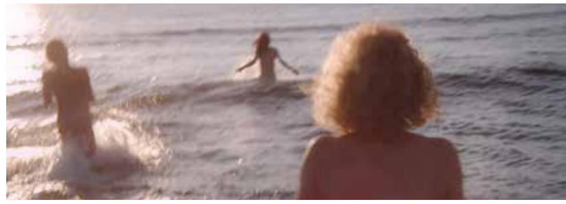
Nothing Can Stop Us Now / The Lesson

Riverbed focuses on auteur-driven storytelling with a strong emhasis on powerful imagery. Its films have shown success in film festivals as well as in the Latvian box-office.