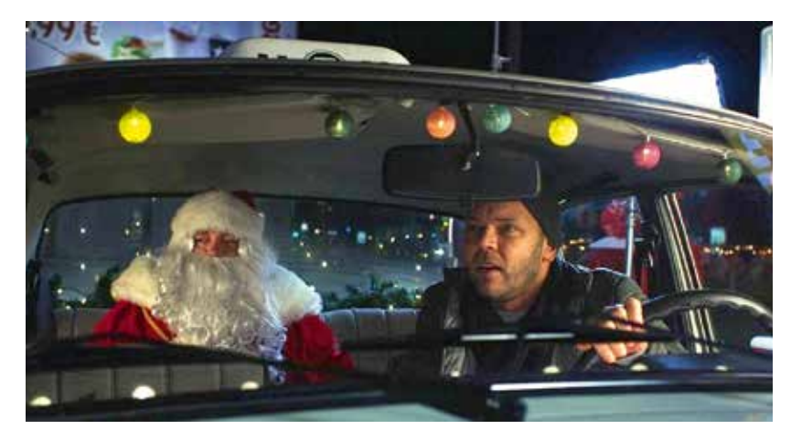
New Year's Eve Taxi 2 In The Land that Sings Loss