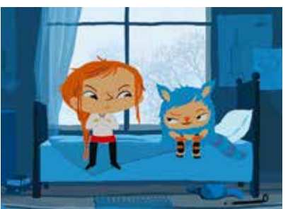
Jacob, Mimmi and the Talking Dogs / Kafka in Love / Pigtail and Mr Sleeplessness

Animation Studio Atom Art works in two main directions – developing and producing quality children's content in different formats (TV specials, series and features) and producing artistic short films in various animation techniques.