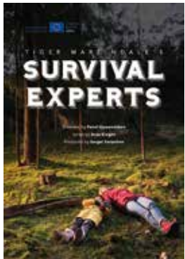
The Immortal / Blinded / Tiger Martindale Survival Experts

Fiction films / Documentaries / TV projects / Film Production Service