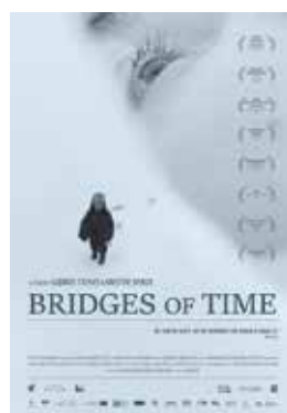
The Rossellinis / Upurga / Bridges of Time

VFS Films is a production company with a 20-year presence in world markets. Known for its award-winning co-productions, VFS houses an Avid shared storage editing environment, colour grading suites, a 5.1 sound studio and a 70 m<sup>2</sup> film pavilion.