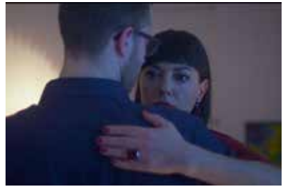
Manny / The Pit / Tango

Marana Productions is a full-service company that has produced commercials, music videos, shorts, documentaries and feature films. In recent years, it focuses on international co-production film projects, bringing together Latvia's best film industry professionals.