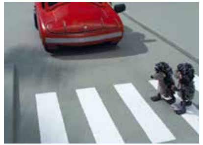
London Holidays / Pea Children / Hedgehogs and the City

Founded in 1996 by Arnolds Burovs, a director of theatre and puppet films, Film Studio Animācijas Brigāde has produced over 100 puppet films. It produces puppet films, puppet film series and commercials.