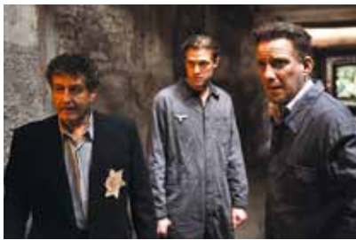
My Father the Spy / Samuel's Travels / The Mover

Operating since 2000, the company Mistrus Media has established itself as a leading Latvian film studio. The company works on international co-productions and provides quality production services, including professional crews to help achieve perfection in the execution of your project.