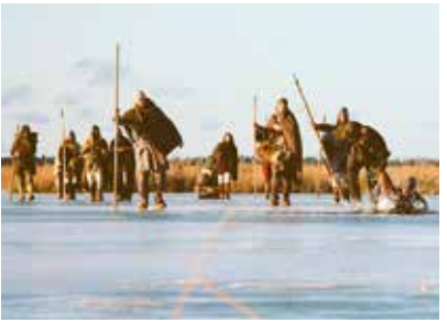
Leftovers & Leftlovers / Troubled Minds / Baltic Tribes - Last Pagans of Europe

Tritone Studio is a film production, post-production and animation studio created and run by artists since 2009. Company offers coproducing opportunities for various artistic and weird film and animation projects.