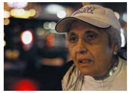
The Wanderers / Neon Spring / One Ticket Please

Deep Sea Studios is an arts collective and film production company based in Riga, Latvia. Founded by young artists and producers, it operates as a platform from which new talents work alongside experienced professionals to create new and enriching artistic experiences.