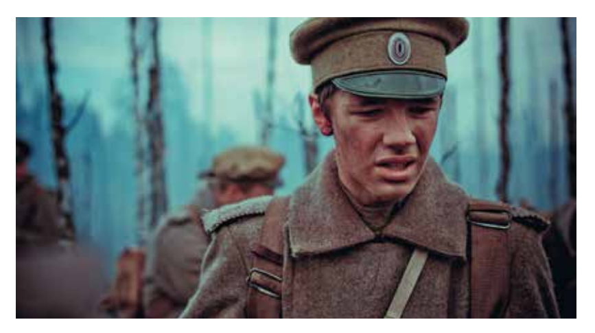
Blizzard of Souls

KULTFILMA produces large scale film projects involving not only governmental funding, but also sponsorship, media partnership, PR and advertising agencies. Latest feature Blizzard of Souls is the No.1 Box Office Sensation in Latvia in over 30 years.