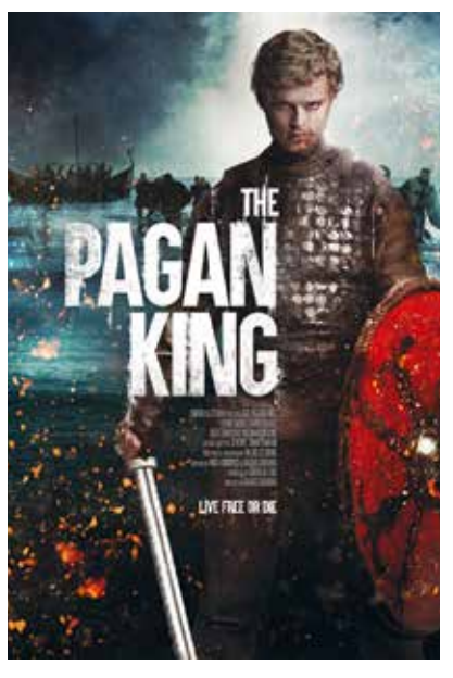
Accidental Santa / The Pagan King

Platforma filma is the most successful commercial movie studio in Latvia. The mission of the company is to create entertaining and contemporary intellectual property, and to engage local audiences with global values.