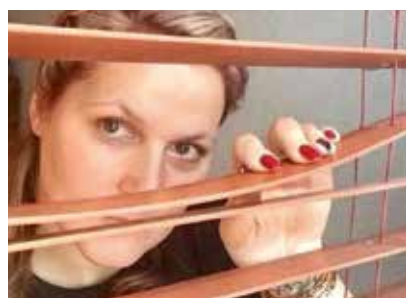
Solving My Mother / 24 Hr Sunshine / My Mother the State

The Latvian film production company FA Filma produces feature films and documentaries with high artistic merit. Their films have won numerous festival awards and are distributed internationally.