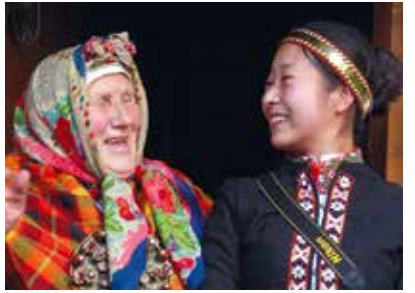
Bille / Soviet Milk / Ruch and Norie

Established in 1991, Film Studio DEVIŅI is an active player in the film industry. With a mission that includes the telling of compelling stories that both entertain and educate audiences, the company focuses on the co-production of feature films and documentaries.