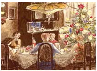
Eight Stars / BREAKTHROUGH. Konstantins Raudive / Little Bird's Diary

Founded in 2004, Studio CENTRUMS is a film production company that focuses on documentaries. The company has also been active in film distribution and other projects (computer games, a virtual museum, educational films and commercials).