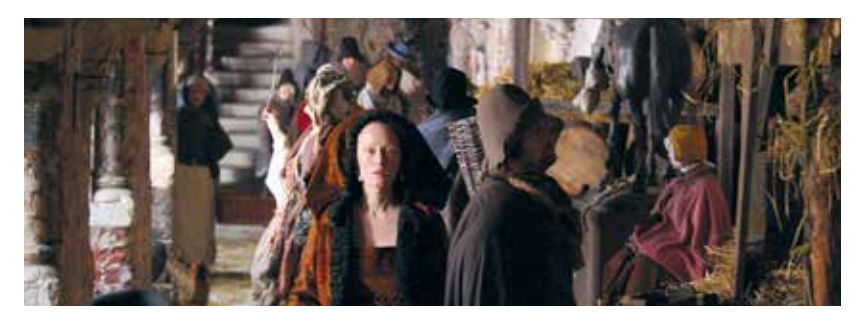
What Silent Gerda Knows / Gulf Stream Under the Iceberg